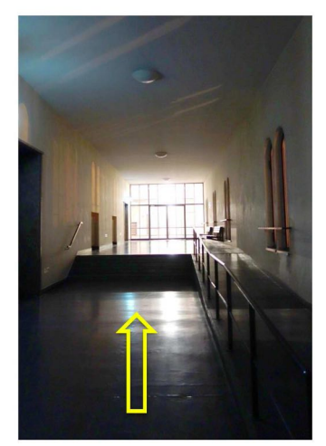
You have reached the coffee room and it looks like this: